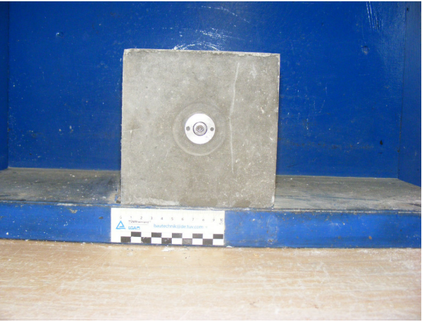
Fig. No. 8 Sample S6 View from below