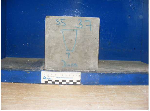
Fig. No. 4

Test Report No. 94615431-003 dated 23rd August 2013