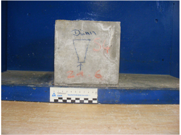
Fig No. 1