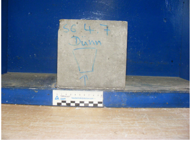
Fig. No. 7

Test Report No. 94615431-003 dated 23rd August 2013