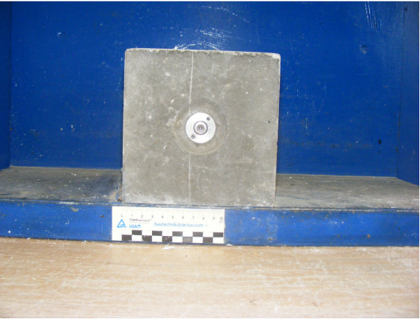
Fig. No. 5 Sample S5 View from below