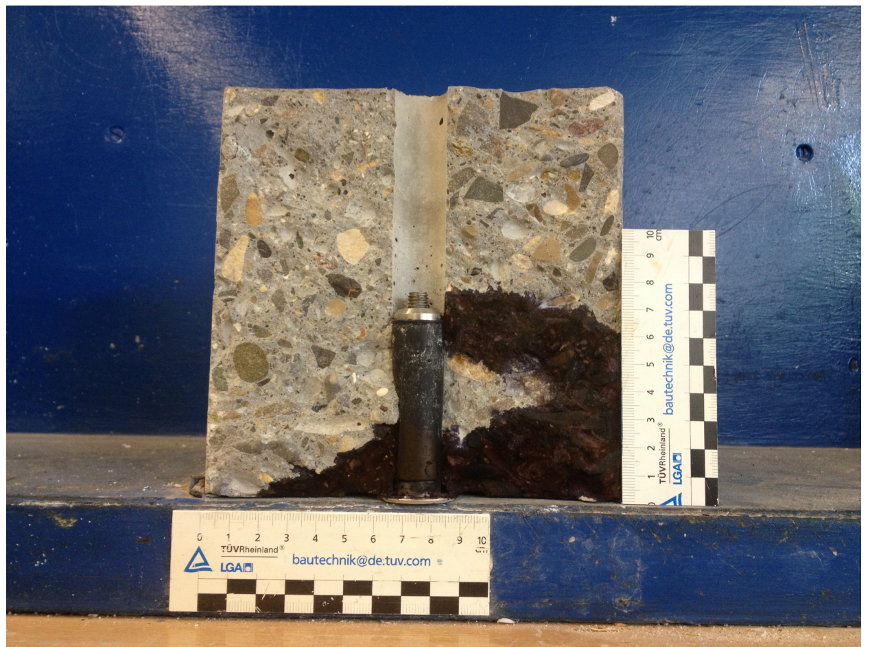
Fig. No. 6 Sample S5 Water penetration