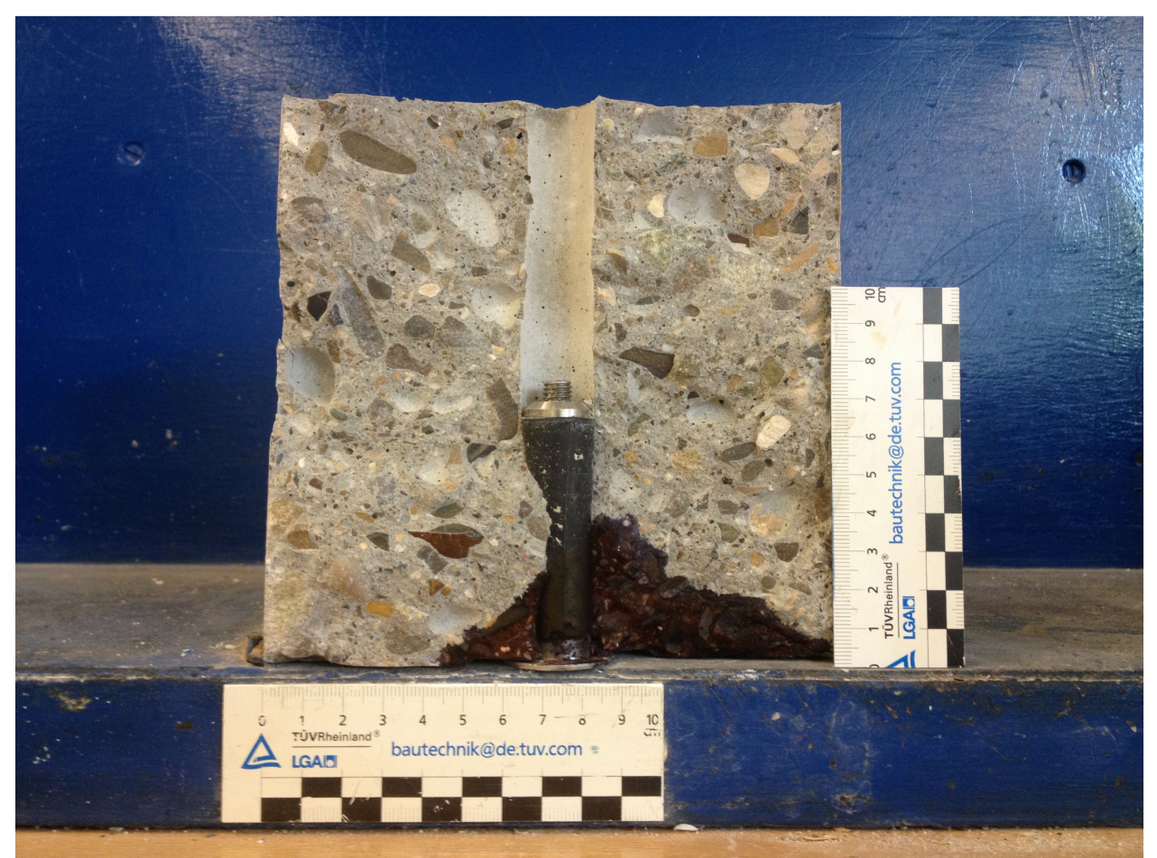
Fig No. 3 Sample S4 Water penetration