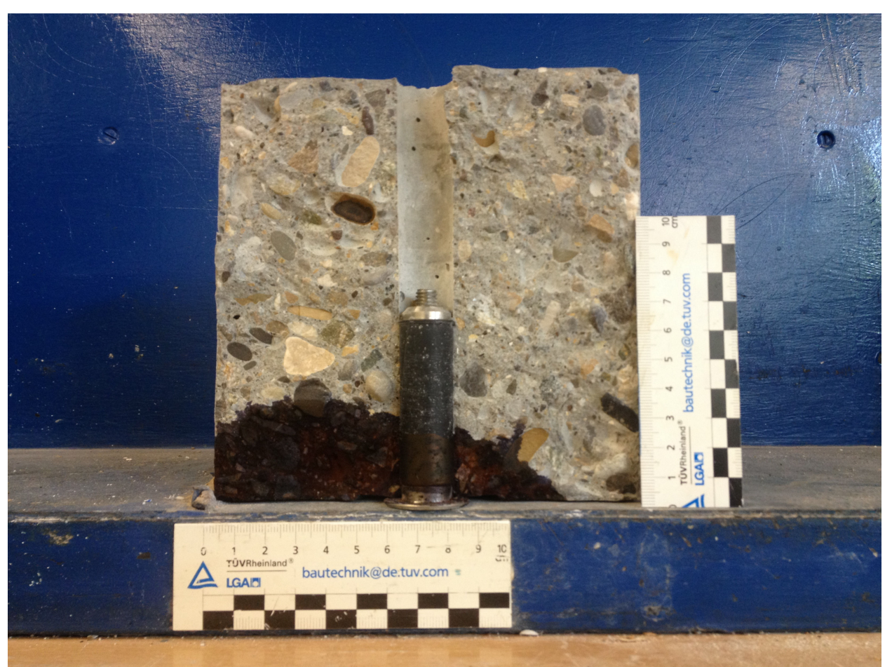
Fig. No. 9 Sample S6 W