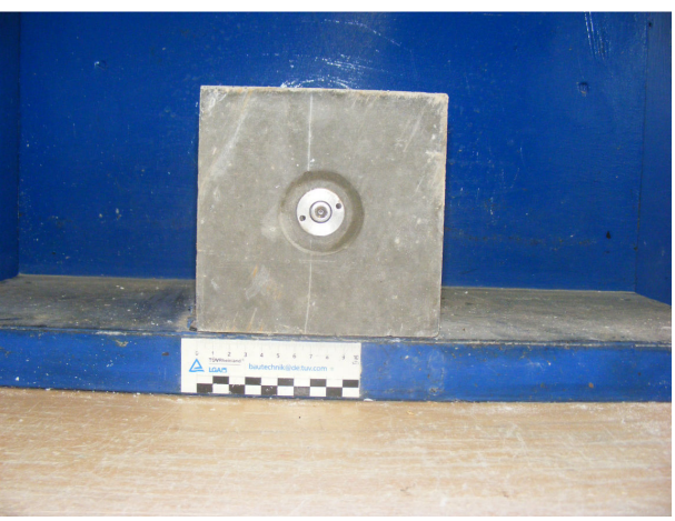
Fig. No. 2 Sample S4 View from below