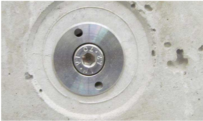
Screw plug "Schraub-stopfen MX 15-50 MF-LS" Unexposed face before fire test