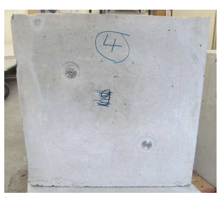
Exposed face before Photo 3 fire test