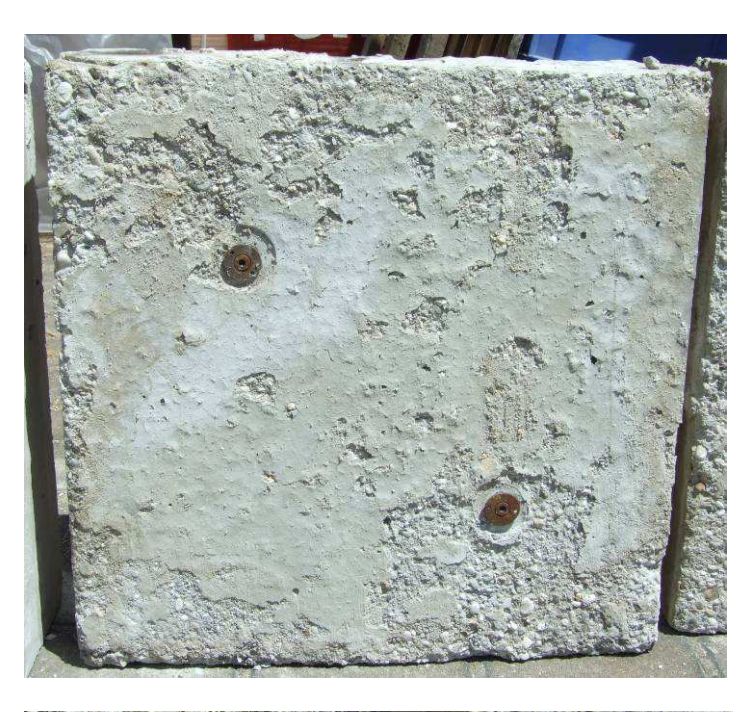
Exposed face after fire Photo 7 test