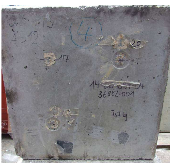
Unexposed face after Photo 5 fire test