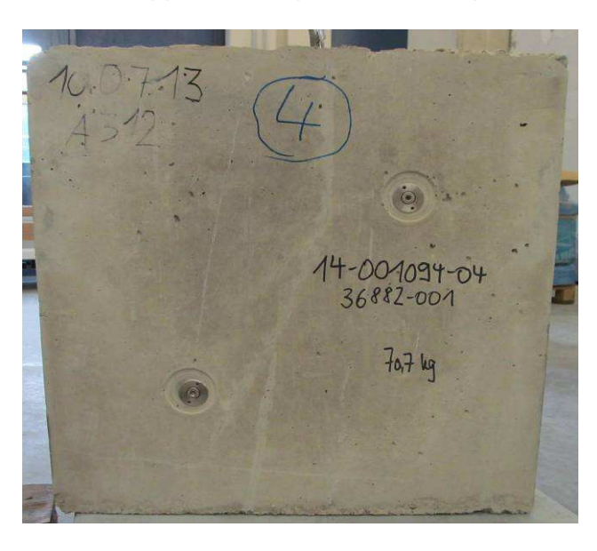
Unexposed face before Photo 1 fire test