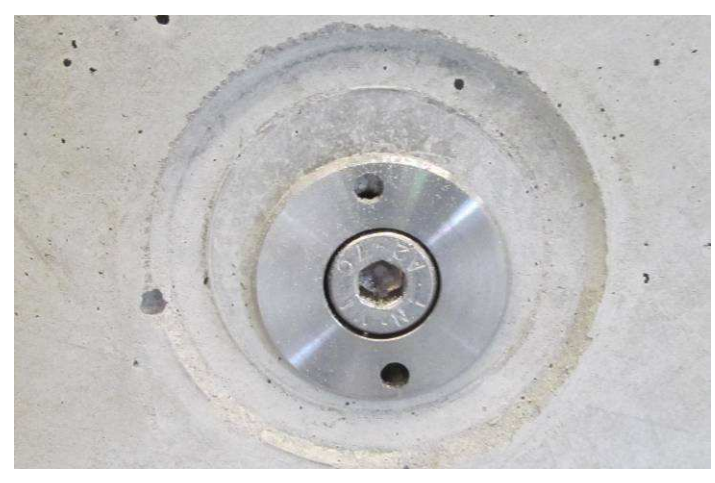
Screw plug "Schraubstopfen MX 15-50 MF-LS" Exposed face before Photo 4 fire test